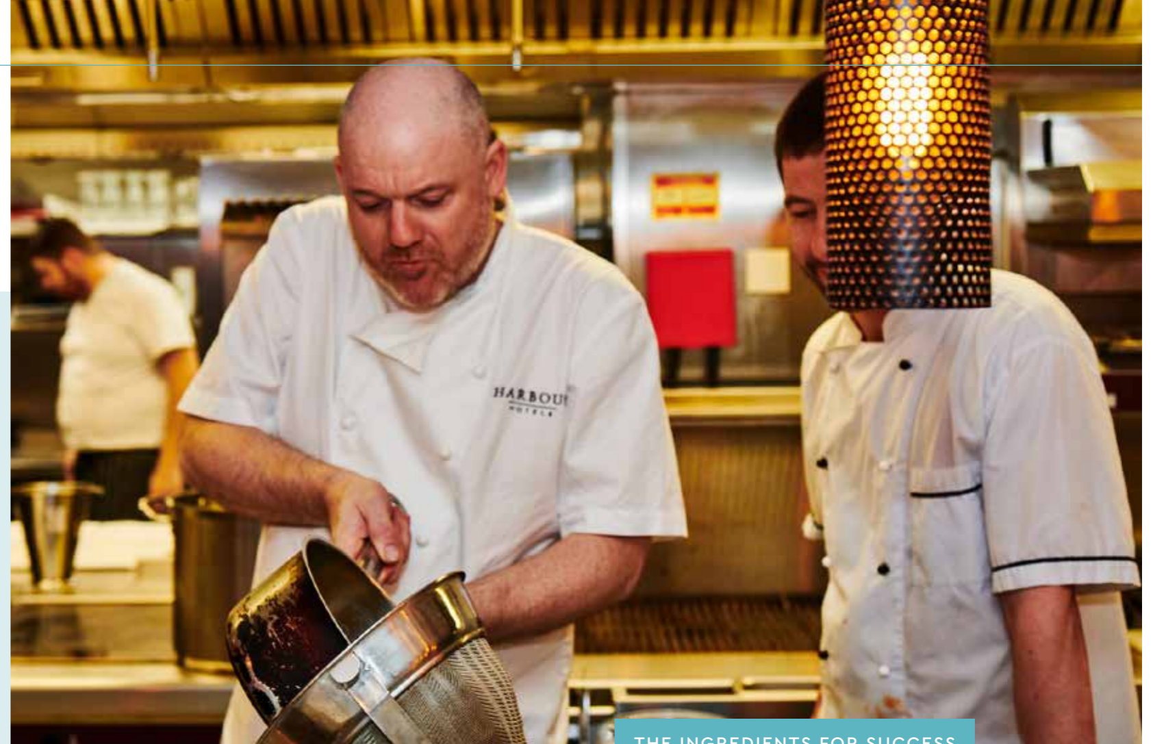
THE INGREDIENTS FOR SUCCESS

To onboard a number of highly-energetic, passionate and committed graduates at degree level to the Harbour Hotels Group two-year programme. The outcome: following successful completion, you will be appointed as a HOD and receive continued professional development towards a Hotel Manager or General Manager role.